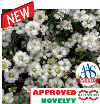
White (Single to Double flowers) PVP