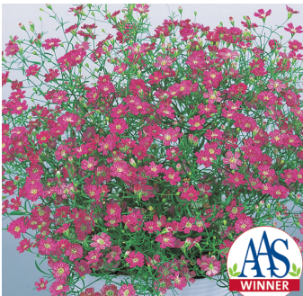
Deep Rose (Semi-double flowers)

Gypsy White : Better mound shaped growth under cold and short day condition and fits to Deep Rose