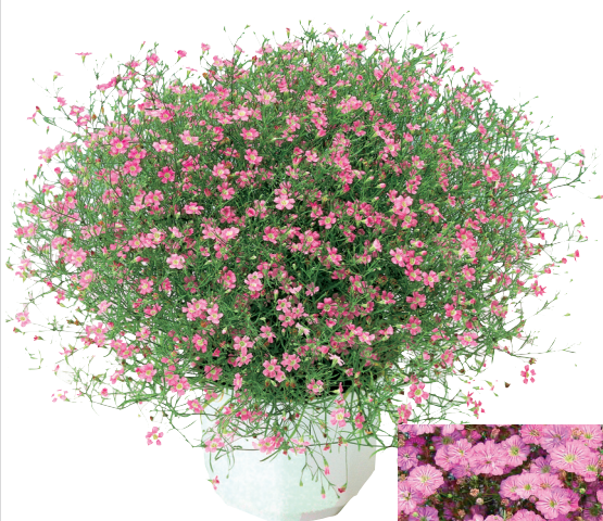
Garden Bride Pink (Single flowers)