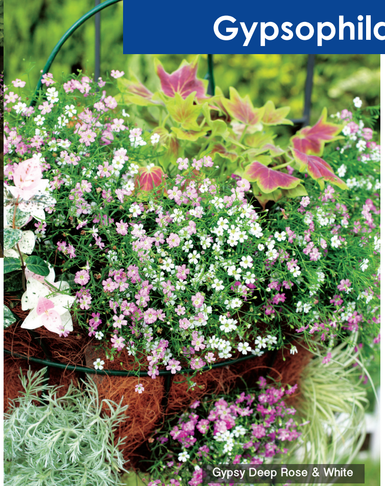
Gypsy Deep Rose & White