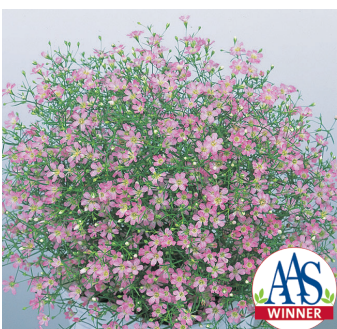
Pink (Semi-double to Single flowers)