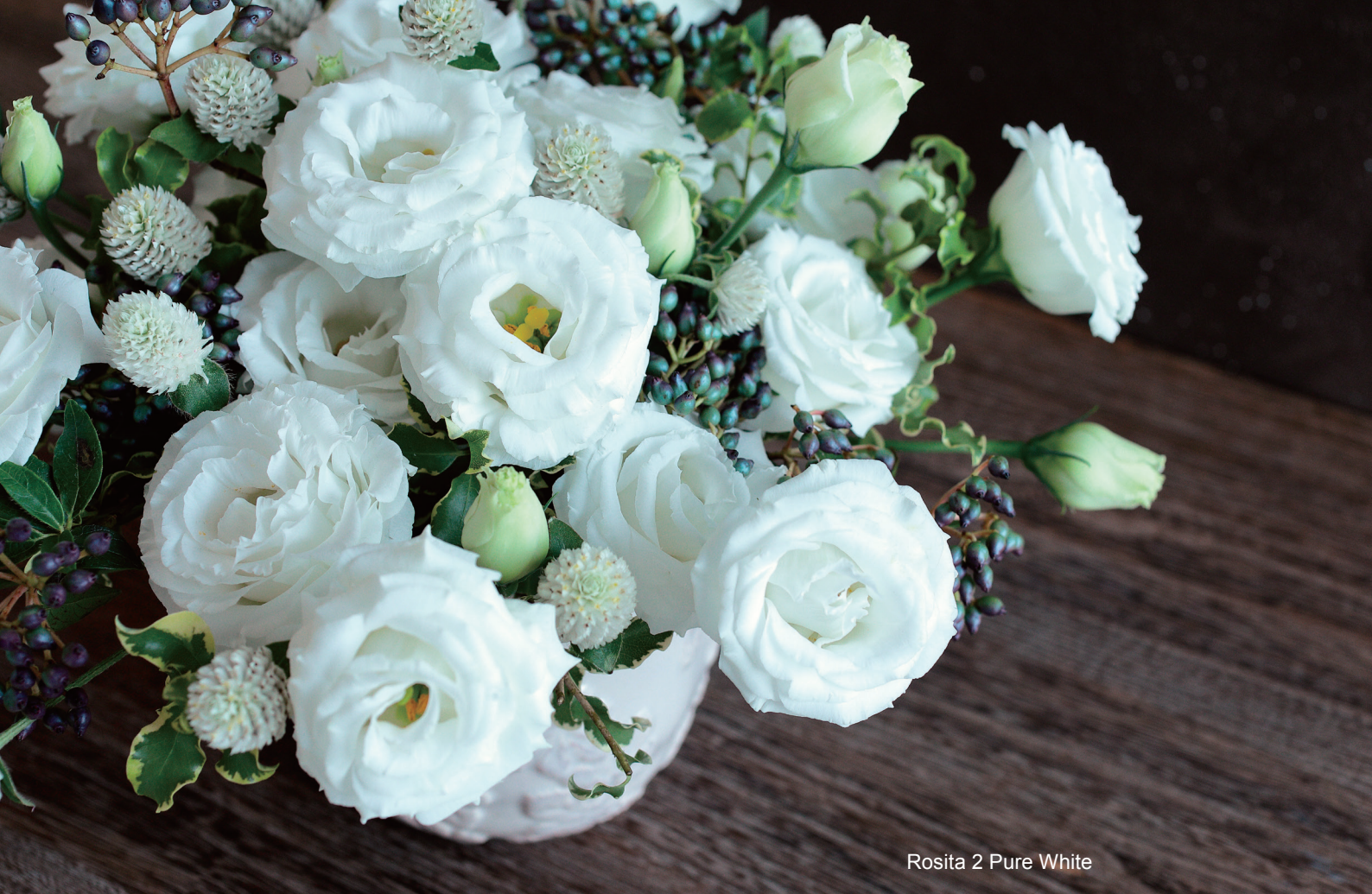
Rosita 2 Pure White