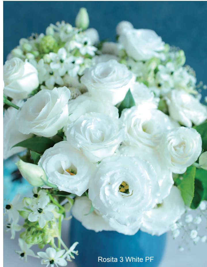
Rosita 3 White PF