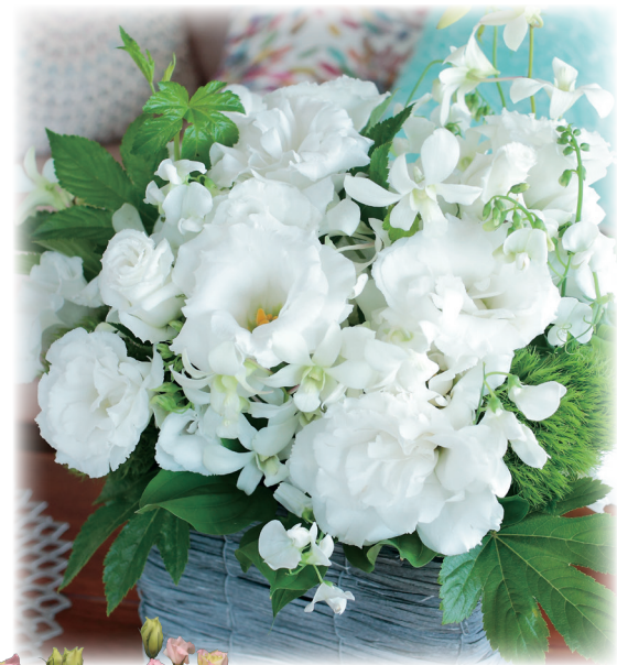
Echo Pure White 335