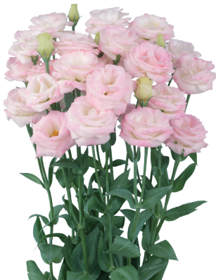
Pink Flash Ver.2