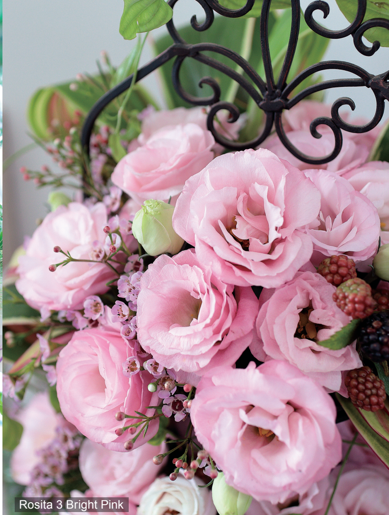
Rosita 3 Bright Pink