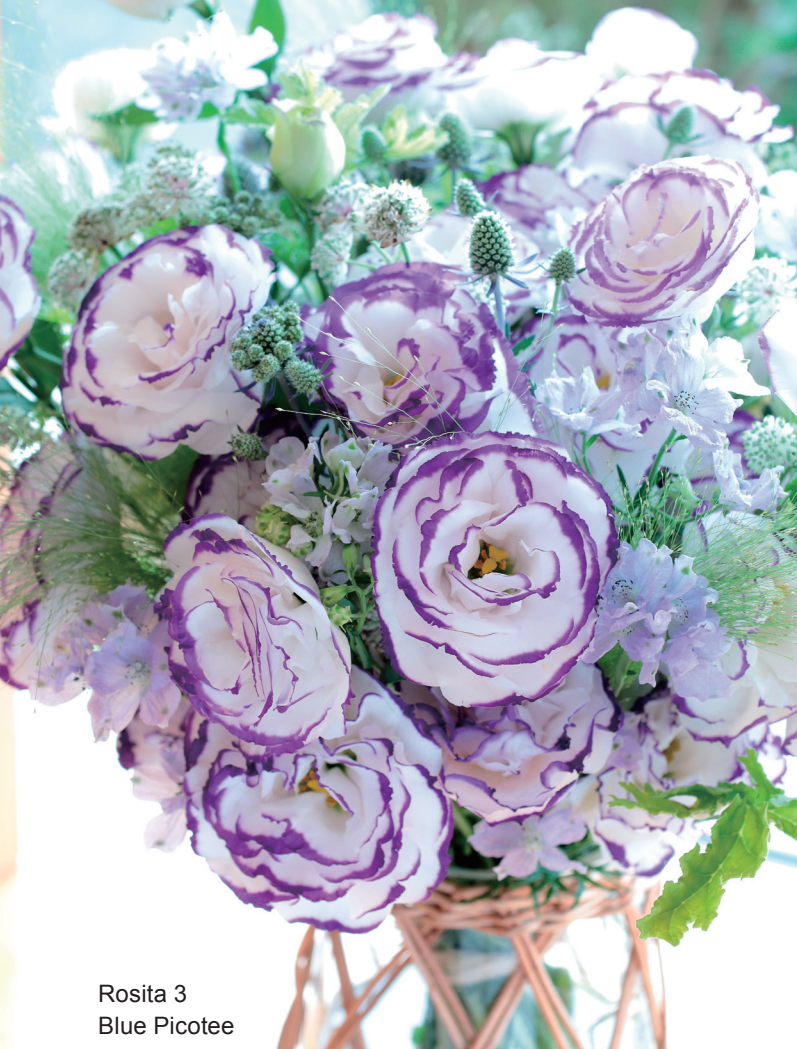
Rosita 3 Blue Picotee