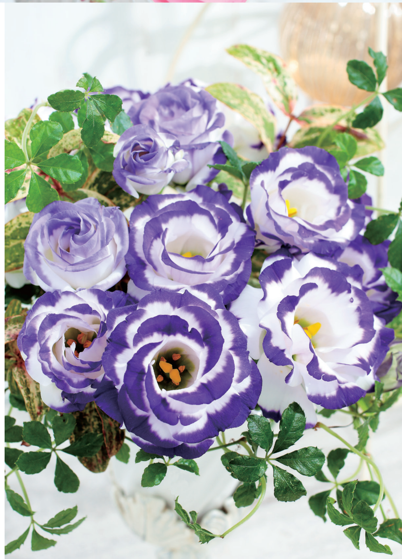
Rosita 2 Blue Picotee