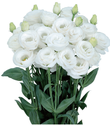
Pure White Ver.3