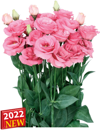
Rose Pink Ver.2