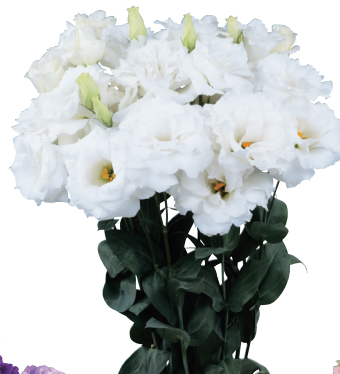
Pure White 335