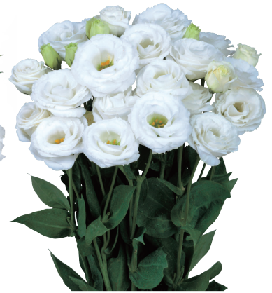
Pure White 611