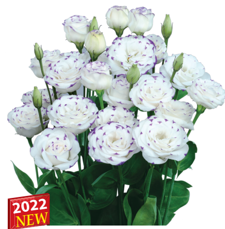
Blue Picotee Ver.2