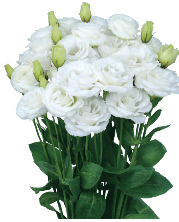
Pure White Ver.2