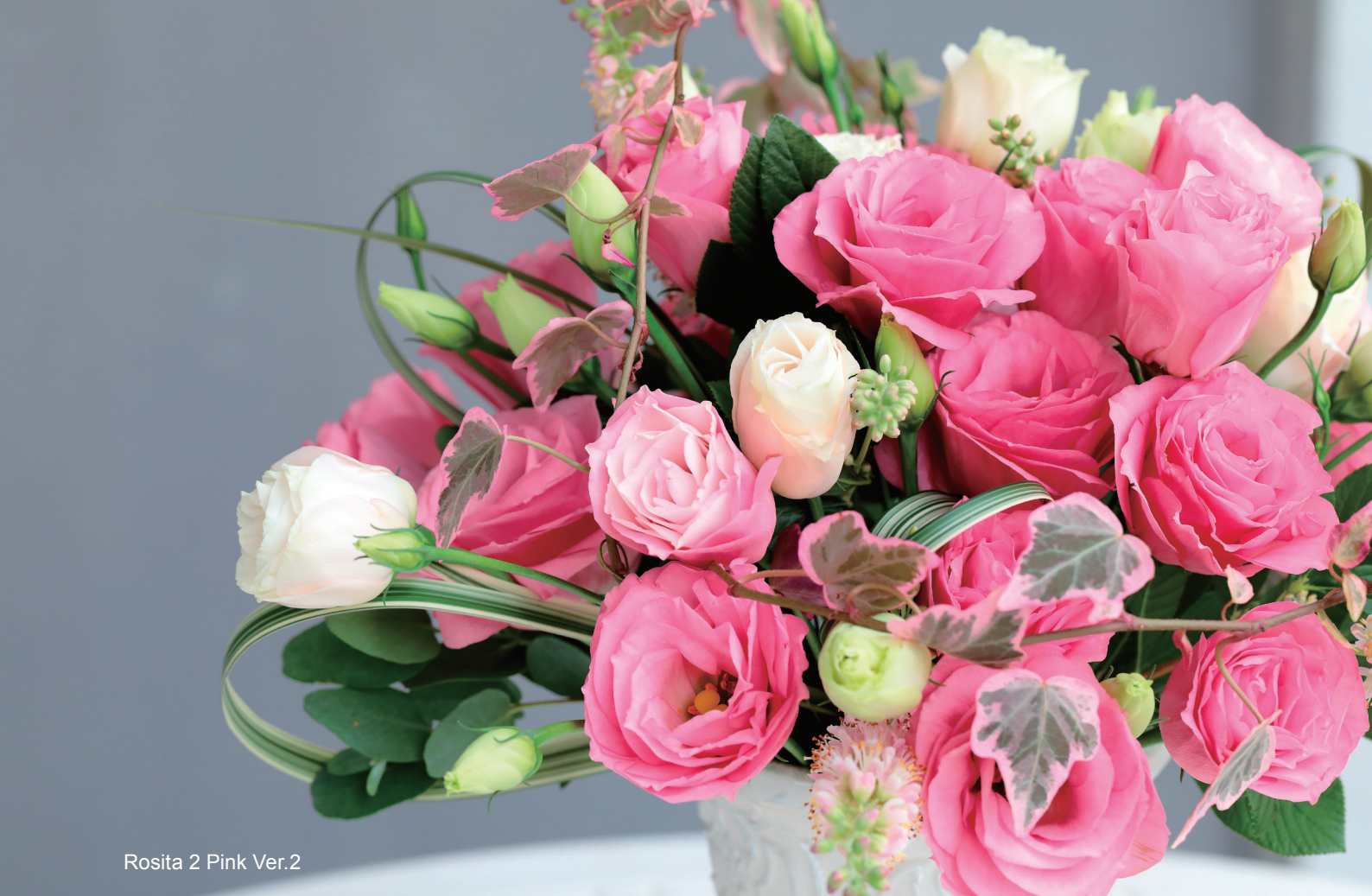
Rosita 2 Pink Ver.2